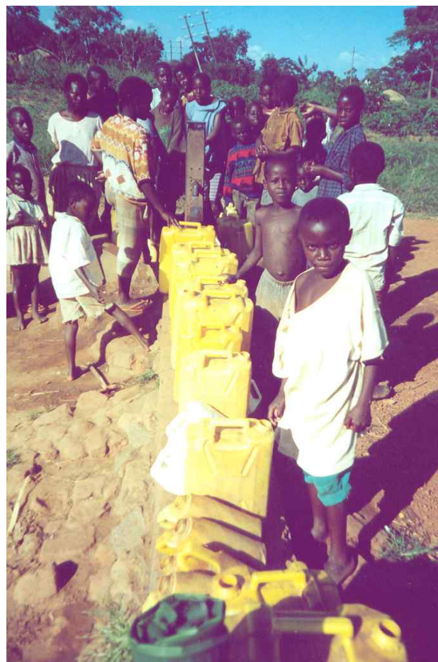
The scene shown above was taken before the afternoon unlocking session – in the time before water carriers took over the maintenance.

the pump, which was removed only by the caretaker and the committee – and then only to a supervised limited timetable and number of people. It meant that the water vendors had no access to the pump during the day. They then came to an agreement with the committee that, in exchange for free access to the pump water, they would undertake the entire cost of pump maintenance.